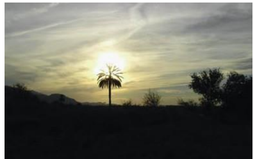
Dusk at El Hondo Natural Park.

We cross Canal de Desvío (19.92) and arrive at a way where we turn right (21.16) parallel to a small canal that is usually dry. This vast plain is only interrupted by the mountains of Sierra de Crevillente that we see in the background. The way ends on a group of eucalyptus trees. We turn left, crossing the canal (23.15) and turn right on the way running parallel to this. We reach a road (23.30) and continue along the asphalted way ahead of us with a canal on its left. The way ends at the entrance of El Hondo Natural Park, to which we ascend across the metal door (23.76) that is usually closed. But if we go a few metres further along the fence on the right, we can continue the way. This stretch is one of the most pleasant of the route, where fishermen and natural ponds inhabited by large numbers of birds are common. We pass another door (27.43) and repeat the previous operation. We arrive at the road (29.18) and follow the signs on the left to visit the Park's Interpretive Centre (30.30) .