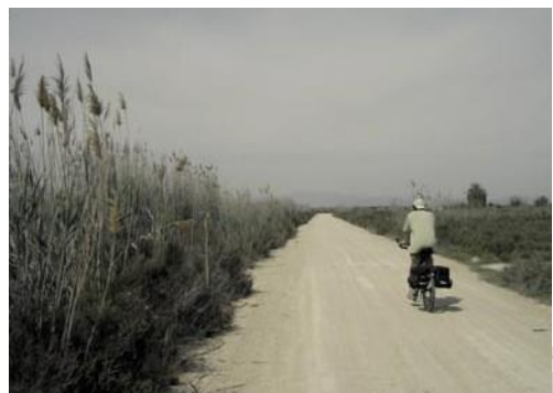
Roads at Salinas Natural Park.

We start off from Santa Pola along the CV-865 motorway to Elche. We leave past "Bahía" camping site and 1 km further we see a rose-colored house named "El Xipreret" on our left. At the sign banning non-authorized vehicles we set the distance meter to 0. We are already within Salinas de Santa Pola Natural Park. We pass a barrier. The road is dirt with a few stones. In the background we can already see one of the lagoons. We take the first road on the right (0.32). Then we pass a road on the left (0.53) and continue straight leaving a building in ruins on our right.