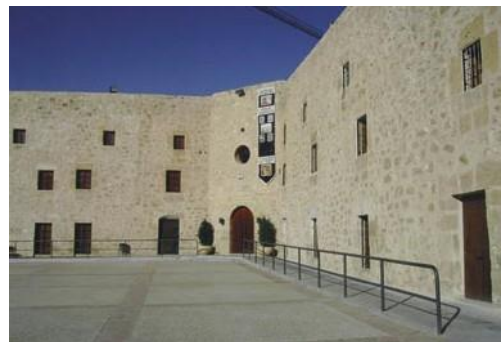
Fortress of Santa Pola